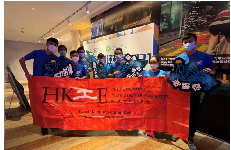
E-Sports Games organized by Construction Industry Council