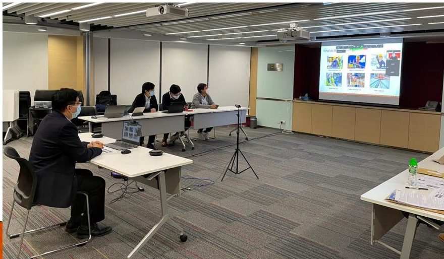
Technical Seminar on Professional Exam