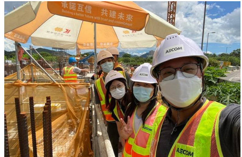
Technical Visit to Shek Wu Hui Sewage Treatment Works