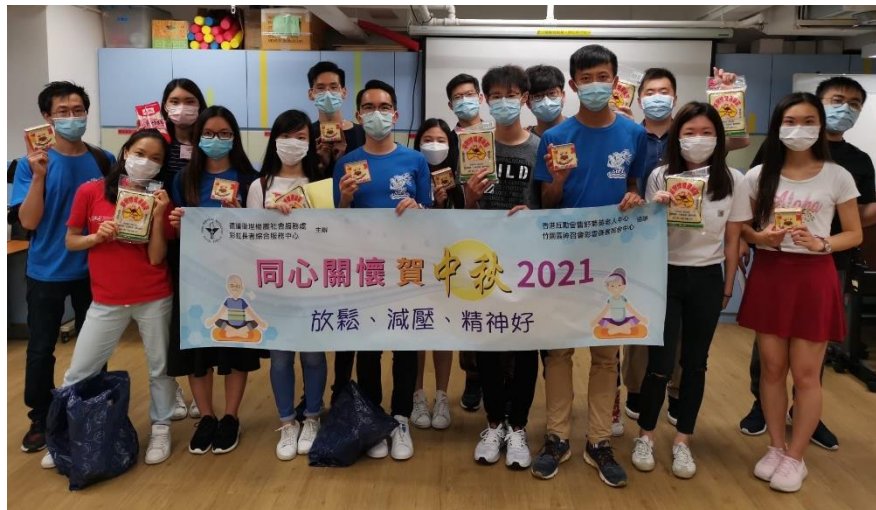
Visiting the Elderly in Mid-Autumn Festival