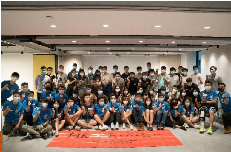
Helpers Orientation Day