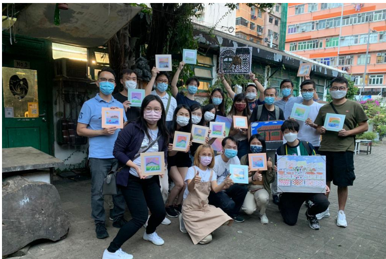
Heritage Tour to Cattle Depot