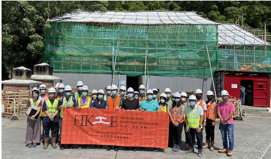
Technical Visit to the Maintenance Works at Tin Hau Temple, Cha Kwo Ling