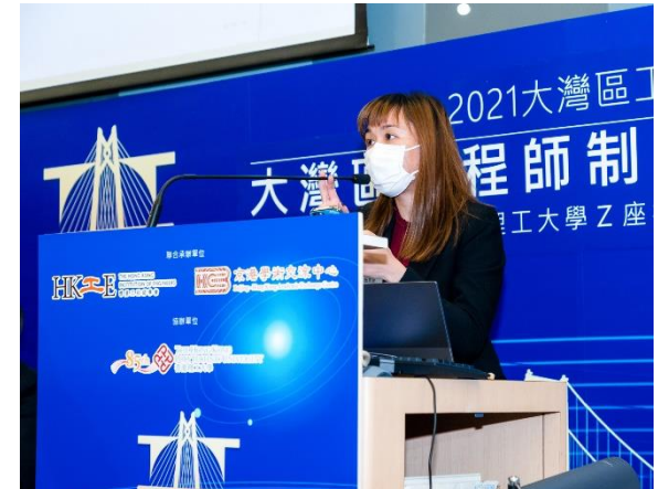
Greater Bay Area Engineers' Forum 2021