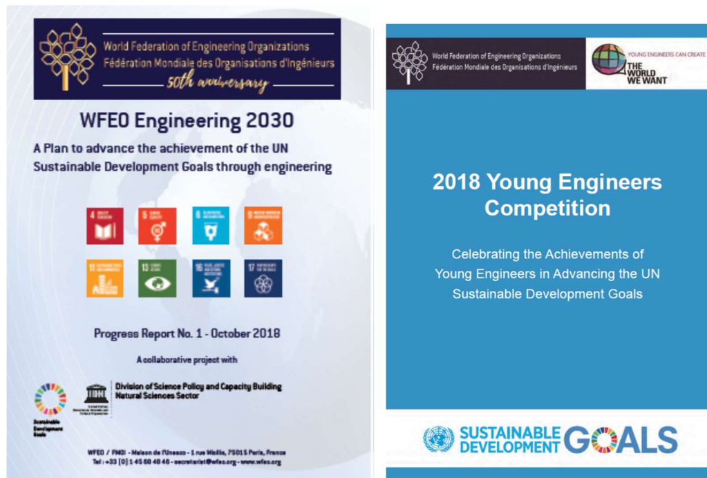
The inaugural report on the WFEO Engineering 2030 Plan and Young Engineers Competition Book were released during GEC2018.