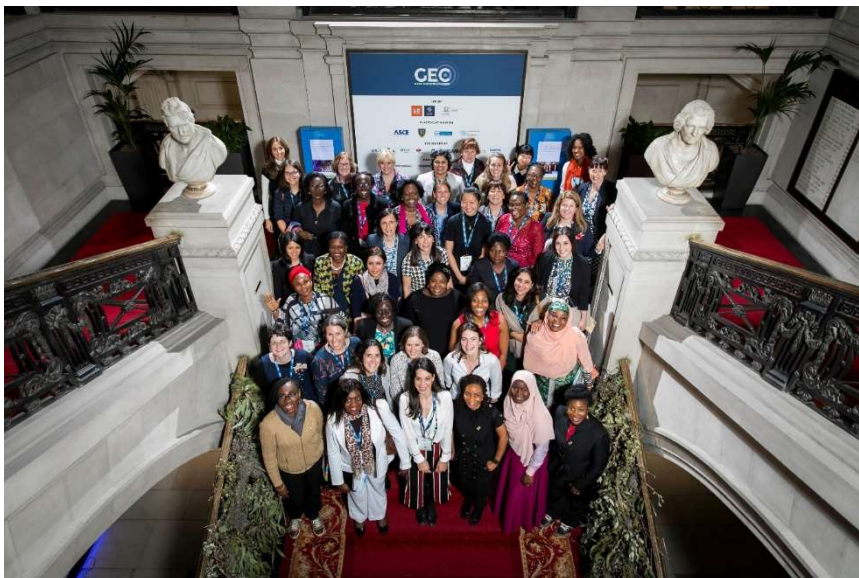
Celebrating Diversity in Engineering at GEC2018

The inaugural WFEO GREE Award for Women in Engineering was presented at the WFEO 50 th Anniversary Gala Dinner. This will be an annual ward that recognises the achievements of women engineers around the world to encourage greater participation of women in engineering and advance the objectives of SDG 5.