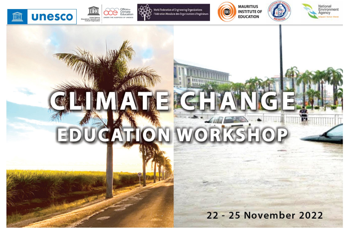
Figure 3: Flyer for Climate Change Workshop

Hands on session put the stress on active pedagogies: experiment, debate, role-playing games, group work, etc. The facilitators animate interactive sessions instead of giving a frontal lecture. Conceptual scenarios are powerful tools to synthetize knowledge, assess the understanding of participants and to prepare for future work on the curriculum. The workshops will include the UNESCO SANDWATCH teaching programme.