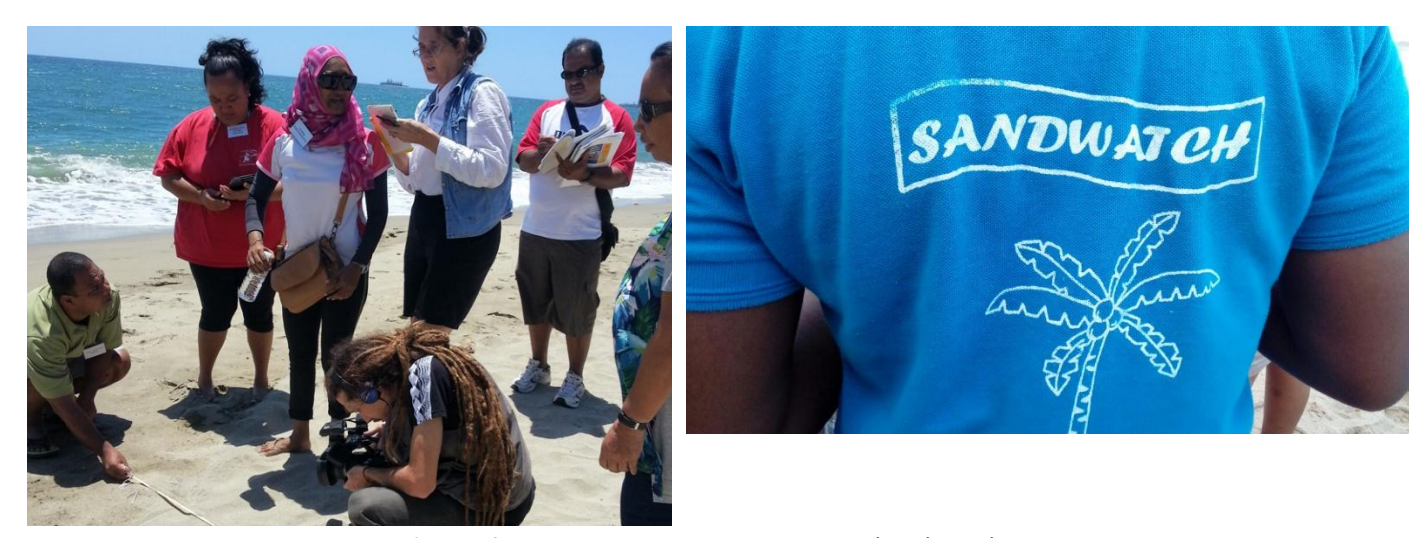
Figure 4: UNESCO SANDWATCH project in action

Hands on session put the stress on active pedagogies: experiment, debate, role-playing games, group work, etc. The facilitators animate interactive sessions instead of giving a frontal lecture. Conceptual scenarios are powerful tools to synthetize knowledge, assess the understanding of participants and to prepare for future work on the curriculum. The workshops will include the UNESCO SANDWATCH teaching programme.