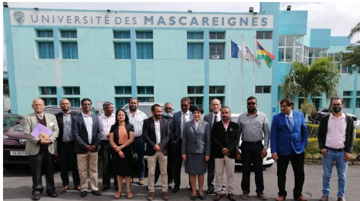
Assessor team (Civil Engg.) and observers at Universite des Mascareignes (UdM) Mauritius 29 June 2022