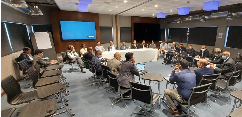
Assessor team for University of Mauritius with Industry representatives and non-participatory observation by mentors, 27 June 2022