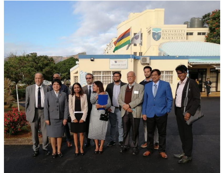
Assessor team (Electronics Engg.) and observers at University of Technology (UTM) Mauritius 29 June 2022