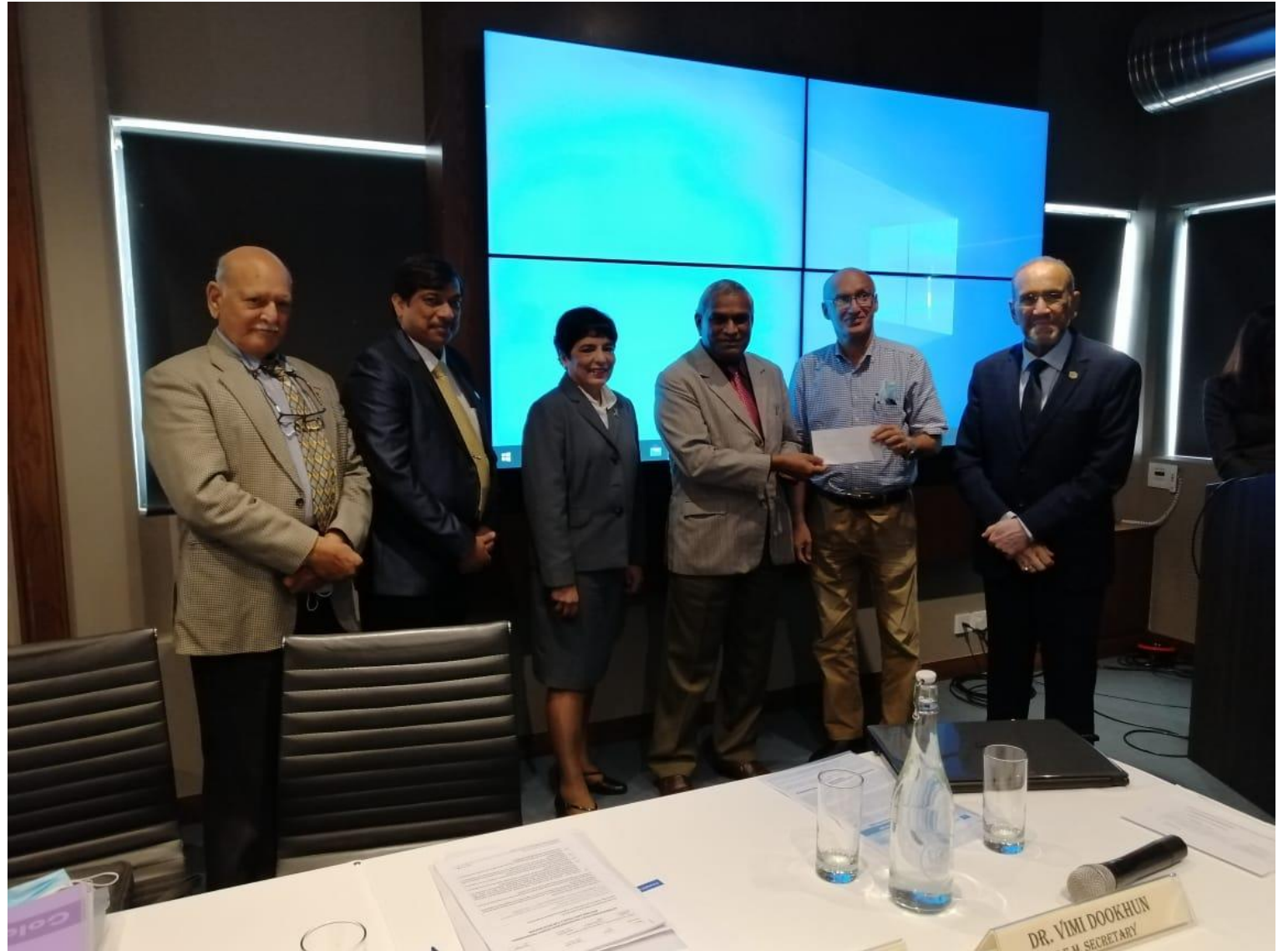
High level political forum on Sustainable Development - 6 July 2022, UNESCO / WFEO