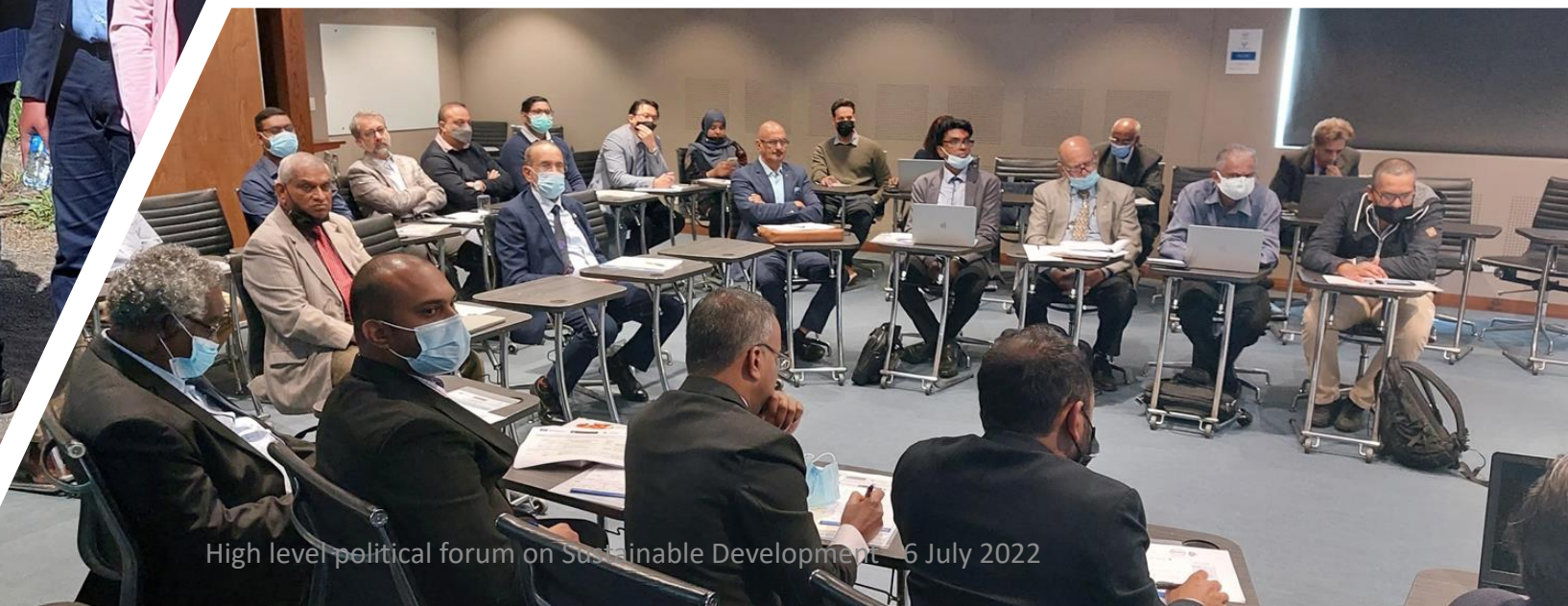
High level political forum on Sustainable Development 6 July 2022